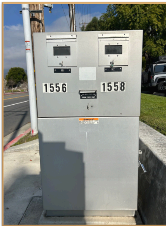
South (Side of Pedestal)