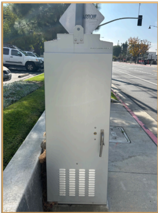
North (Side of Utility Box)