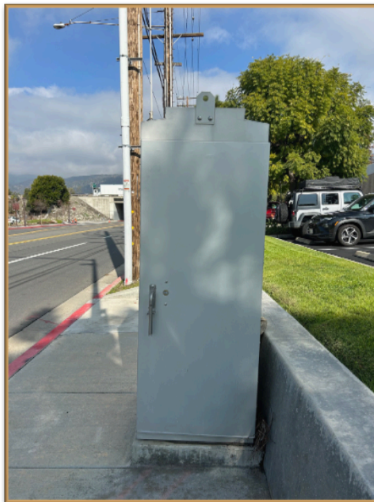
South (Side of Utility Box)