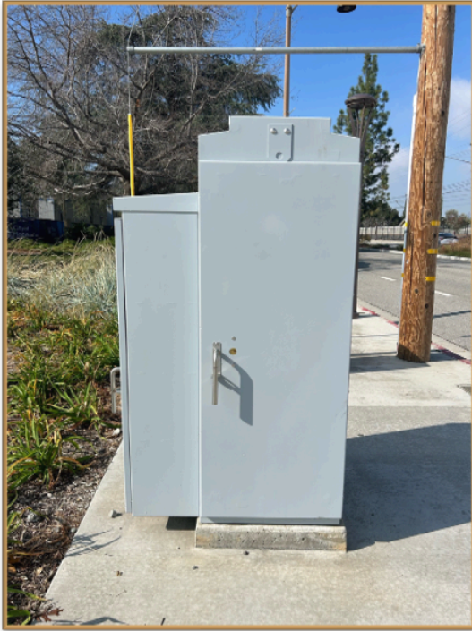
East (Side of Utility Box)