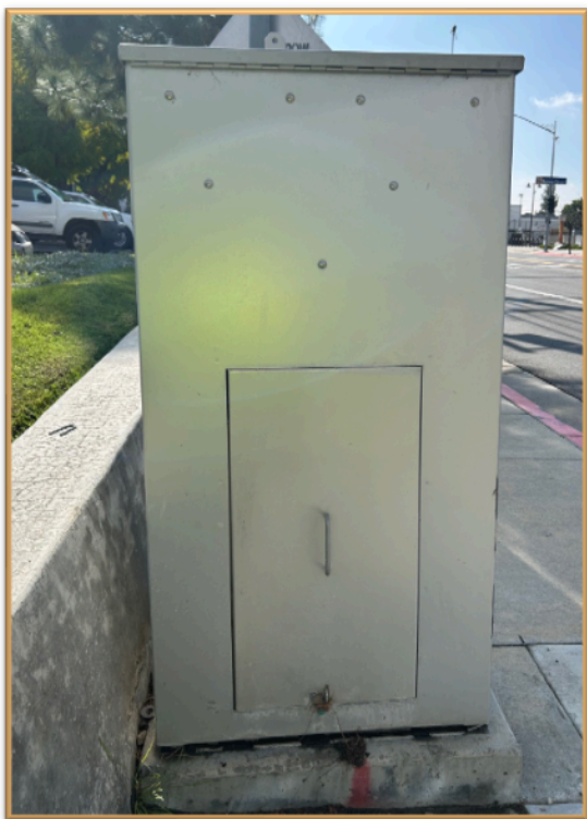
North (Side of Pedestal)