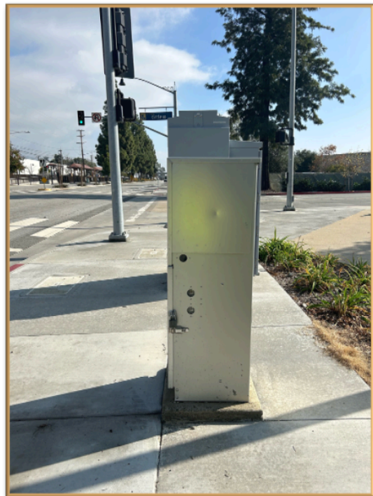
West (Side of Pedestal)