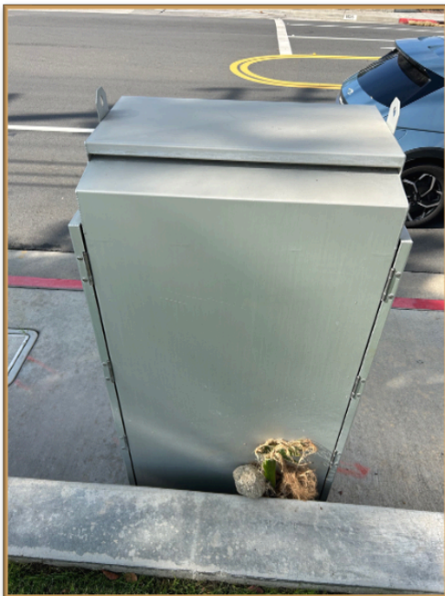
East (Back of Utility Box)