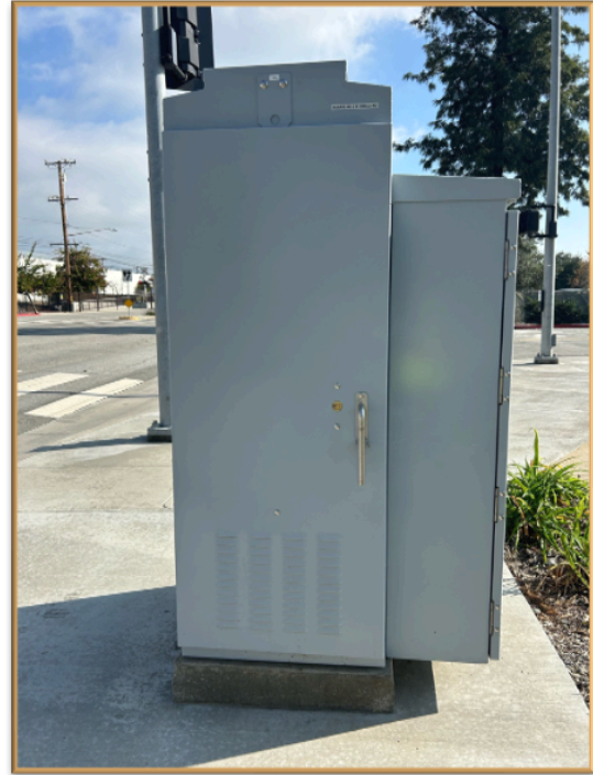
West (Side of Utility Box)