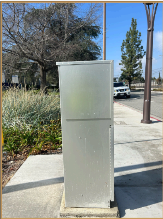
East (Side of Pedestal)