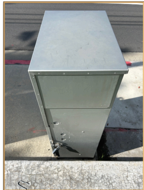
East (Back of Pedestal)